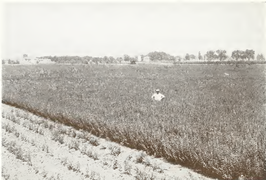
Block of one hundred thousand Ligustrum amurensis , three to four feet.